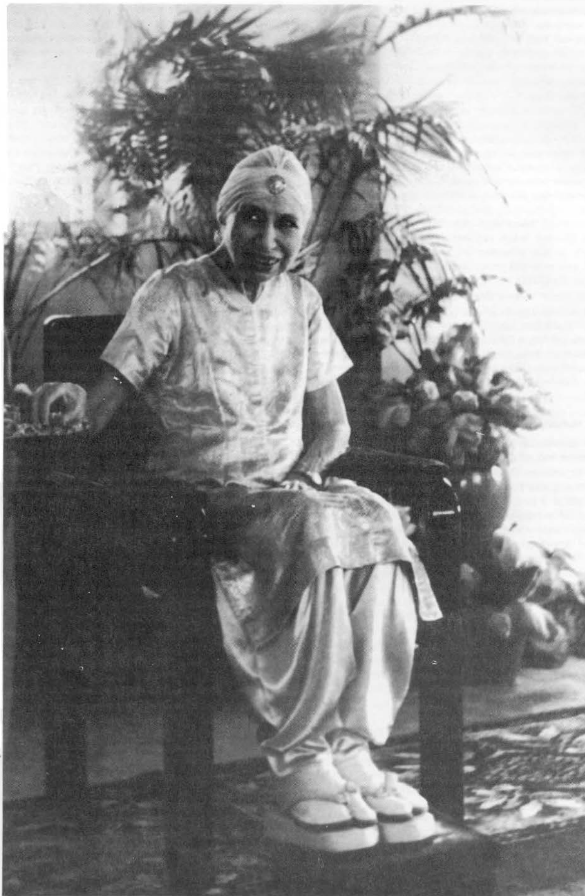
The Mother, 1950s.