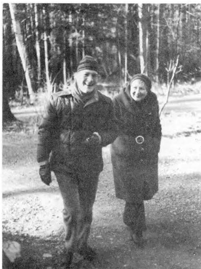
Scenes at Matagiri.