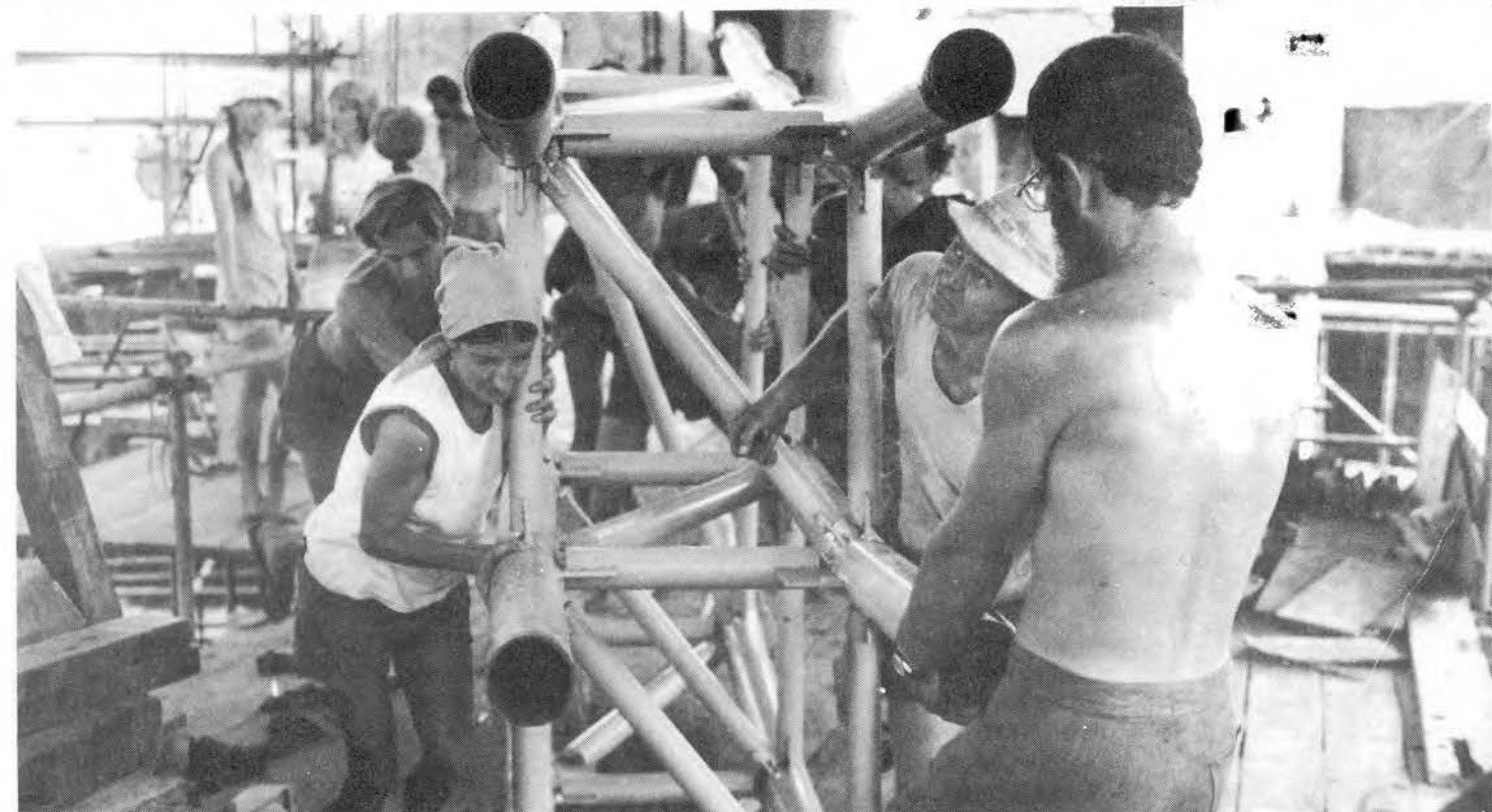
Matrimandir construction, 1979.

For everyone, an objective picture of the events at Matrimandir would be taken, one grey morning, late October 1979: in the newly rearranged office, a dozen or so Aurovilians discussing quietly the different needs and tasks of Auroville's present, in the format of the just reborn Cooperative; in the back room, freshly rewalled, a bunch of gentle "constables" quietly playing cards, and trying to discreetly listen to the radio, to pass time not too badly; on the structure, two Aurovilians busy dismantling a half-rotten wooden tower; in the workshop, a few Aurovilians and a few employees precasting small concrete beams, cutting and welding steel pipes to construct a new crane; out by the sheds, another few Aurovilians clearing off and storing the wooden beams recovered from the old towers; on top of the roofs of some of the sheds, several hired men rethatching and fitting asbestos sheets; nearby, out on the first hill of the Gardens, under a hospitable neem tree, a group of men, once carpenters at Matrimandir, now paid by the Sri Aurobindo Society