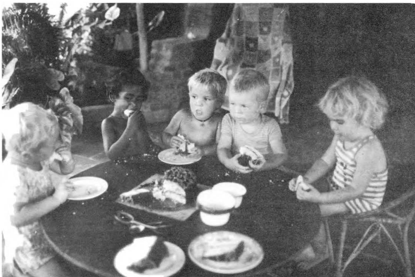
A birthday party in Auroville.