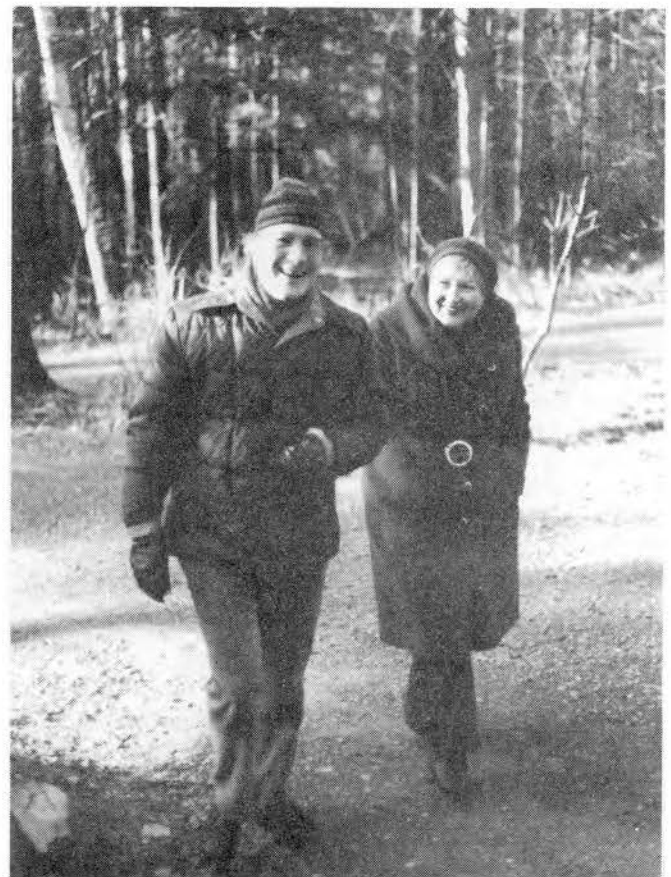
Scenes at Matagiri.