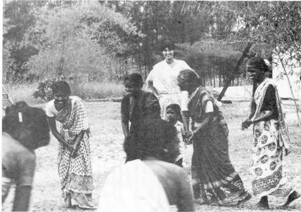
aternity Auroville 197'