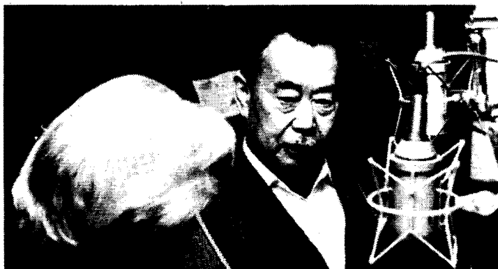
George Nakashima being interviewed on radio by Studs Terkel at the time Nakashima was giving the Mies Van Der Rohe lectures at the Illinois Institute of Technology last fall. He also appeared on the TV program Panorama . Nakashima, whose building and furniture designs have been widely admired, helped in the design and construction of the Sri Aurobindo Ashram guest-house called Golconde.