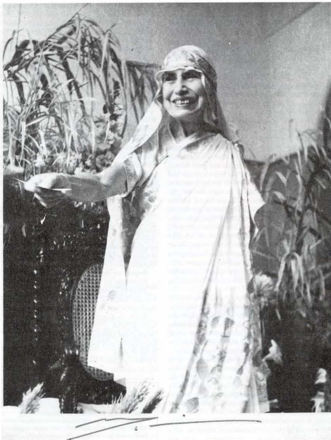
THE MOTHER 21 February 1878 - 17 November 1973