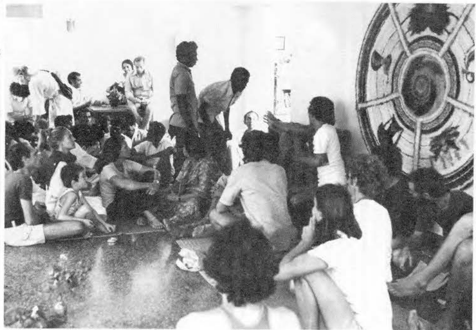
Meeting, Auroville 29 December 1977.