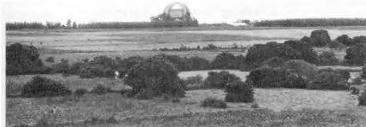
Matrimandir as seen from the top of the windmill at "Shnarga."

In conclusion I quote the words of the Mother: "The conception of Auroville is purely divine and has preceded its execution by many years" (12.4.69). "To work for Auroville is to hasten the advent of a more harmonious Future" (27/3/71).