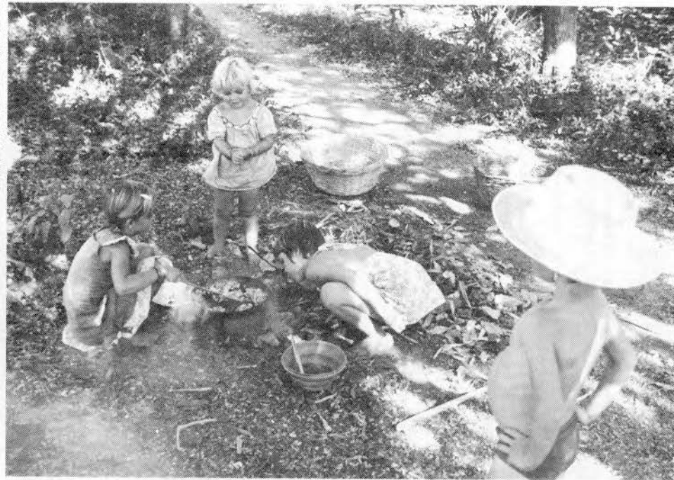
Cooking the woods Auroson' Home, December 197'