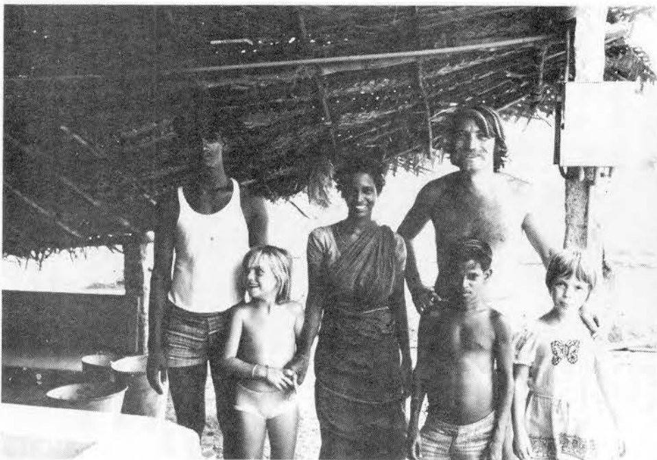
"Shnarga farm, Auroville 1977.