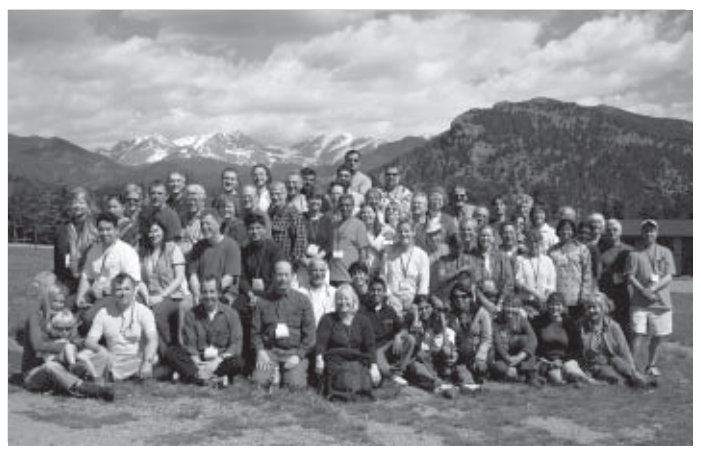
The AUM 2008 group photo, set in the magnificent Rocky Mountains at Estes Park.

In one sense the AUM is over, but in reality it will reverberate for days, months, or years. Some of us will see each other within a week, whereas others we may not encounter again for a decade. Connections made at an AUM tend to weave through our lives in ways we may not recognize. Personally, I had many sweet and touching moments at AUM, and the faces of everyone continue to rise before my eyes. For me, a recluse by inclination, this is all the more meaningful.