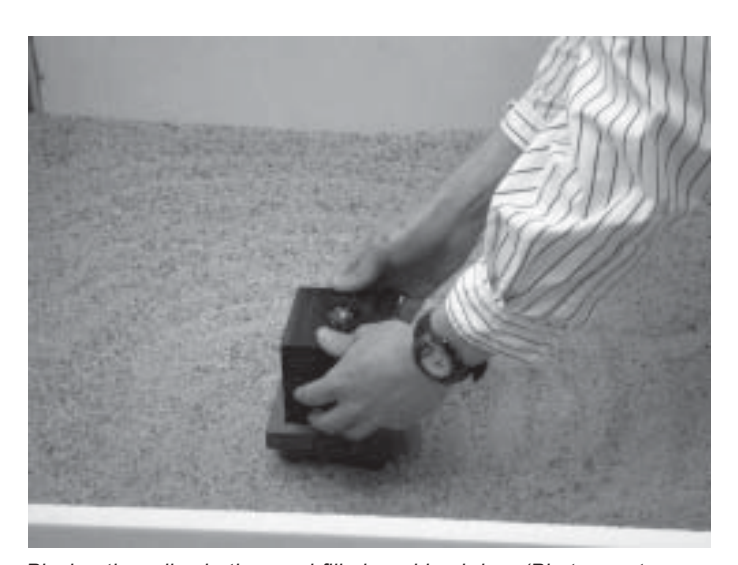
Placing the relics in the sand-filled marble shrine.