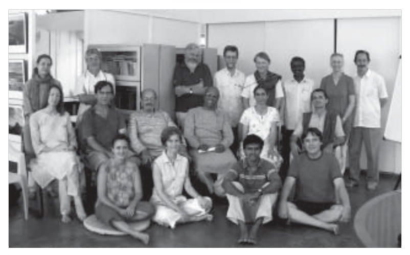
The University of Human Unity Development Team in September 2007

Some of the programs and projects of research and education in Auroville will be: to know the secrets of Nature and of life; to know oneself and to be the master