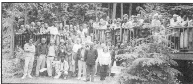
Group of 1990 AUMers