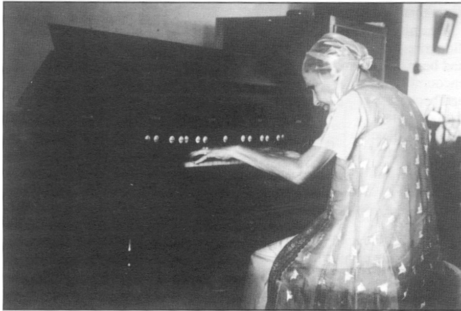
Mother playing the organ