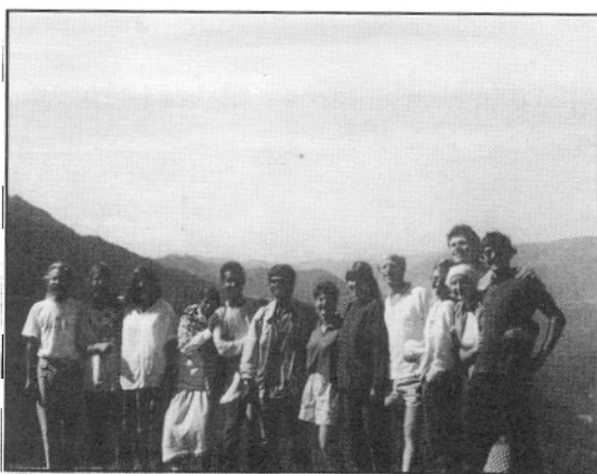
On a hike above camp